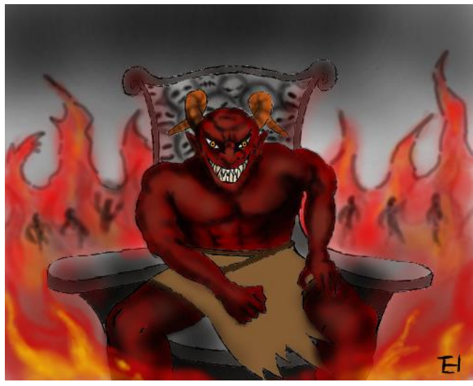
There is a cost for that sin!